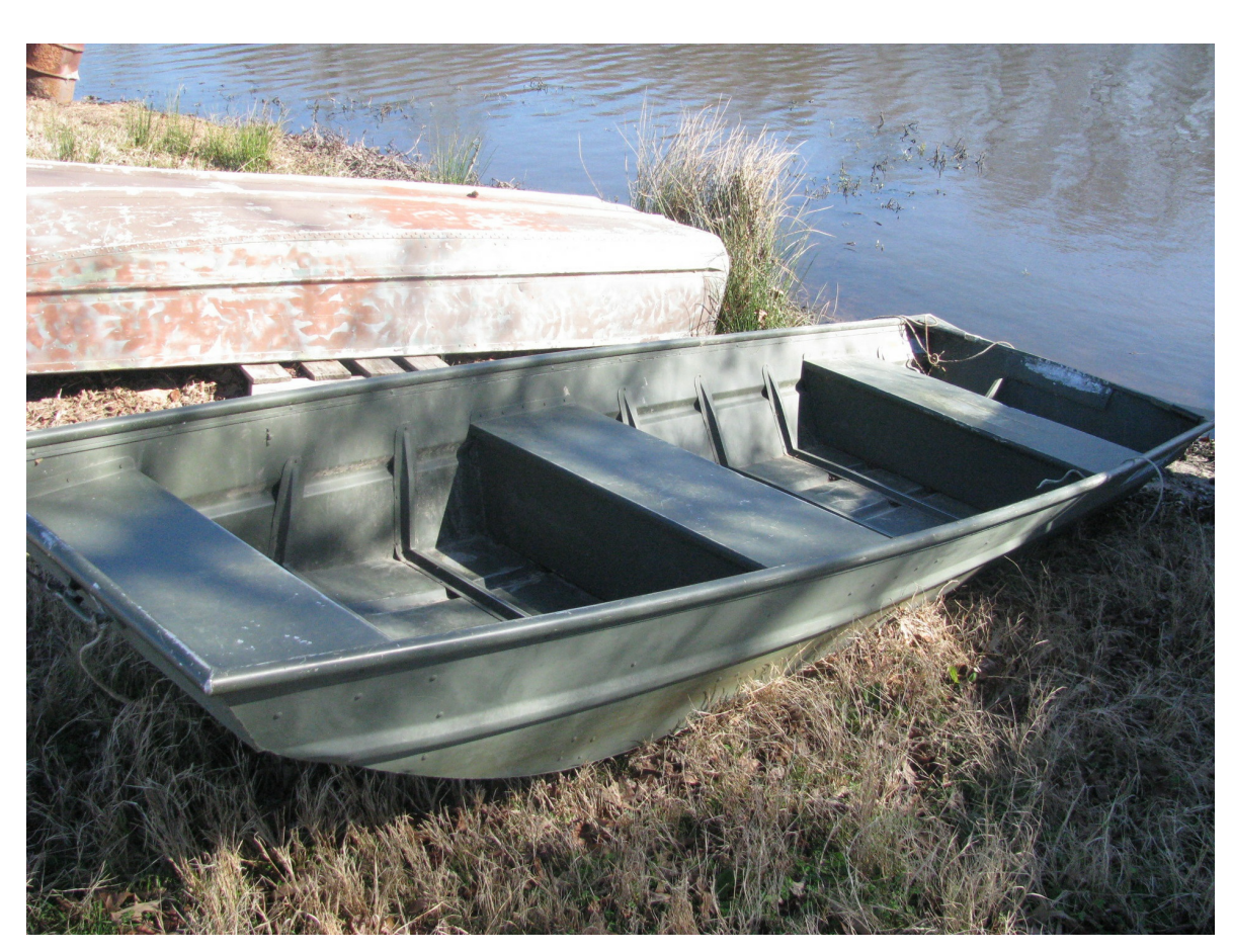
Standard 12 ft. aluminum jon boat at Twin Lakes in Ben Wheeler, Texas